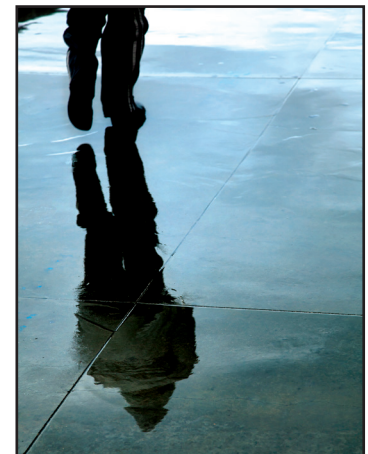
Twelve member brochures about depression.

You can order up to four toolkits at a time for your office. Member brochures can also be ordered separately for your waiting room. Quantities are limited to 50 per order.