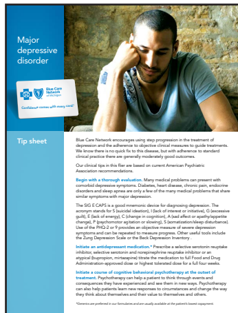
A provider tip sheet for screening and treating depression.