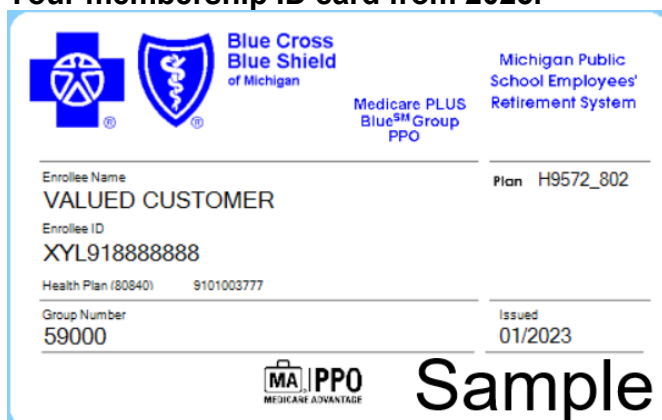
This is an example of a member ID card. Your personalized card will look similar.